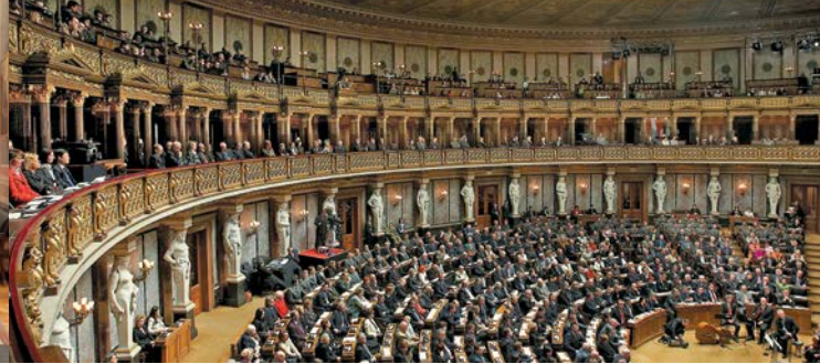
The historic assembly hall