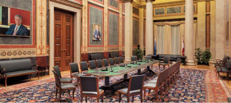
The reception room (presidential lounge)