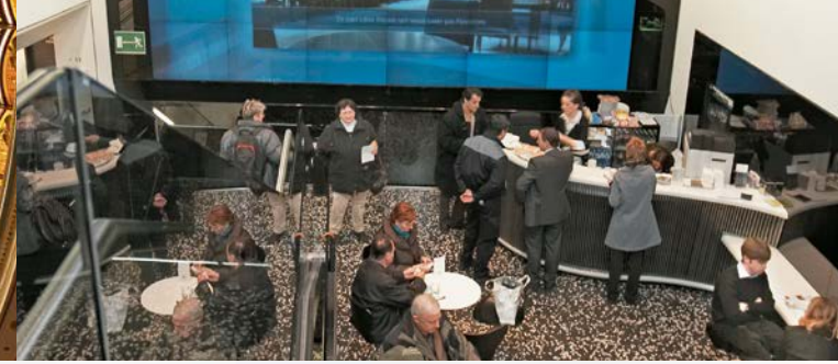
The visitor's centre