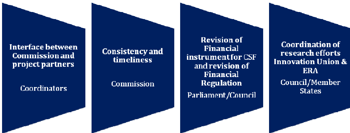
Figure 1: The role of the key players in achieving further simplification