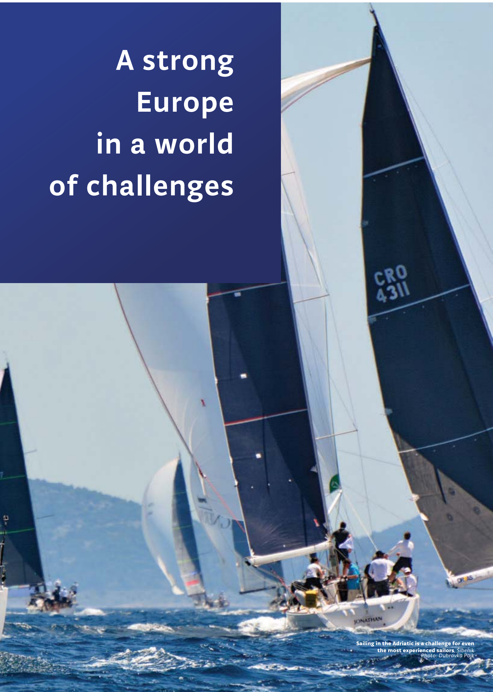
Sailing in the Adriatic is a challenge for even the most experienced sailors. Sibenik