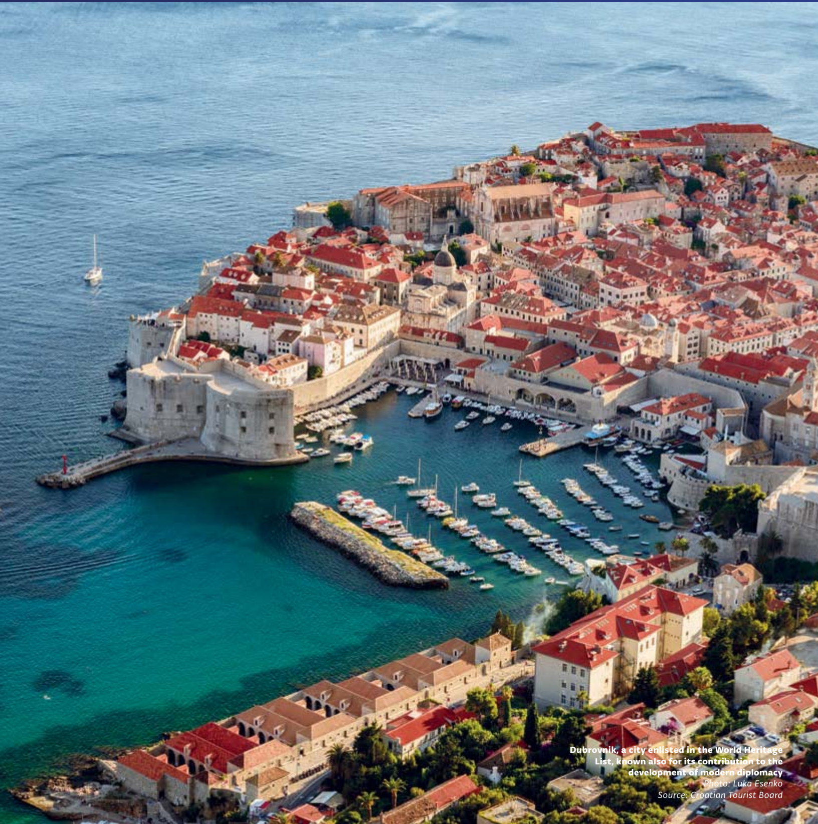
Dubrovnik, a city enlisted in the World Heritage List, known also for its contribution to the development of modern diplomacy