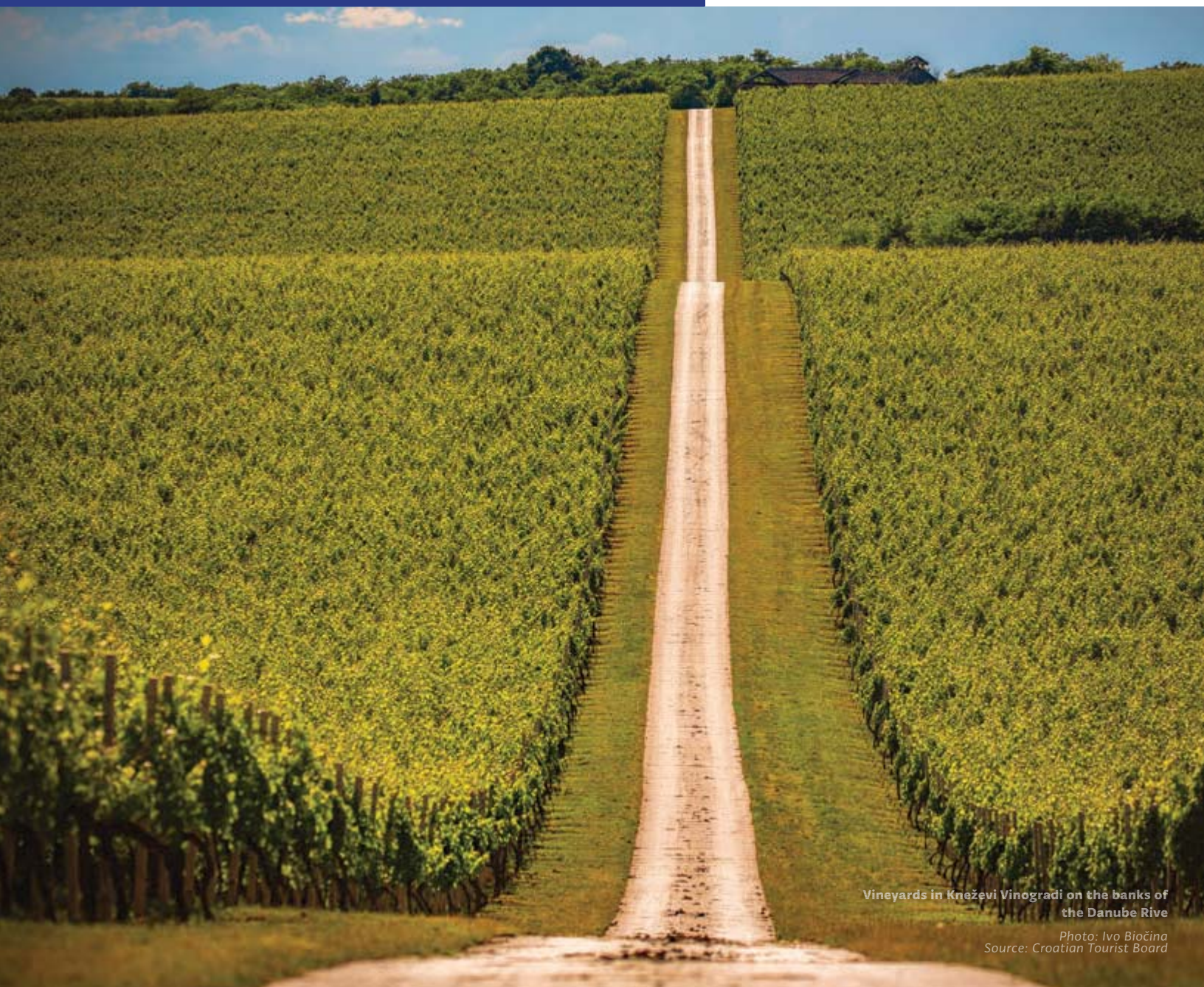
Vineyards in Kneževi Vinogradi on the banks of the Danube River

Croatian Presidency of the Council of the European Union