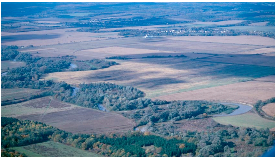
Aerial photograph of the River Rába/Raab