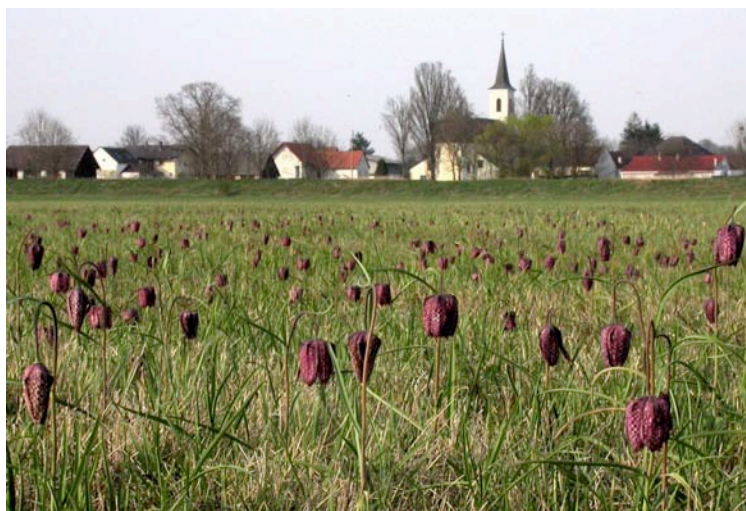
Hagensdorf – Schachblumenwiese