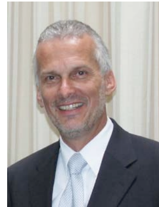
Dr. Josef Moser Präsident Österreichischer Rechnungshof