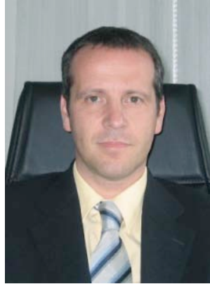
Igor Šoltes Präsident Slowenischer Rechnungshof