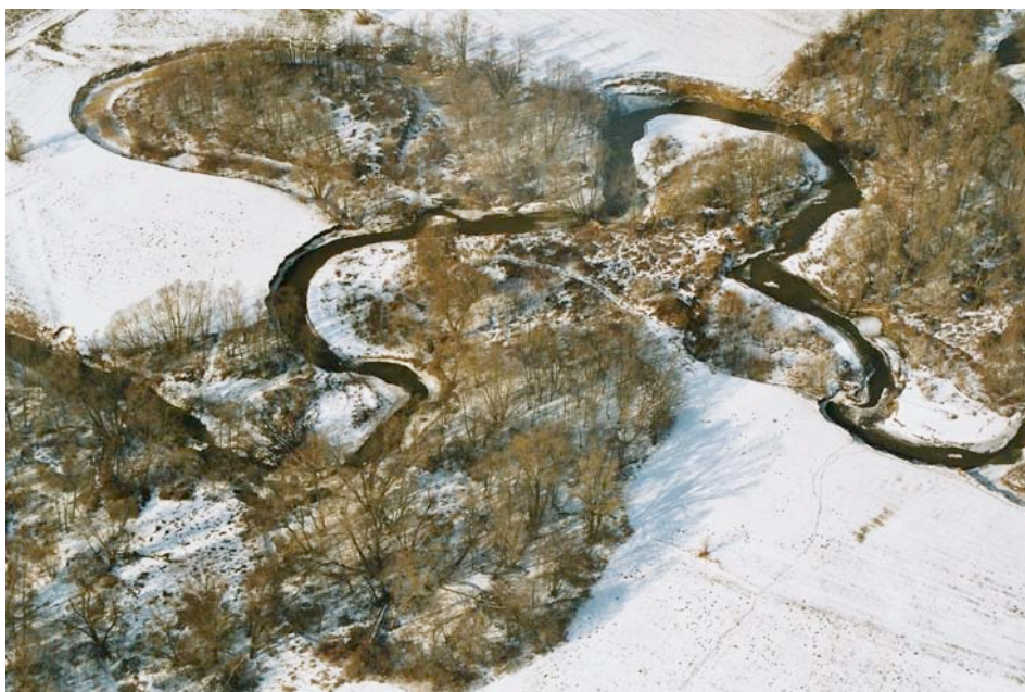
Lafnitz - Bayou