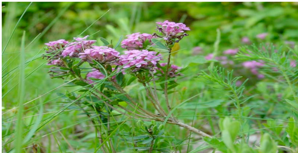
Goričko, the Garland Flower