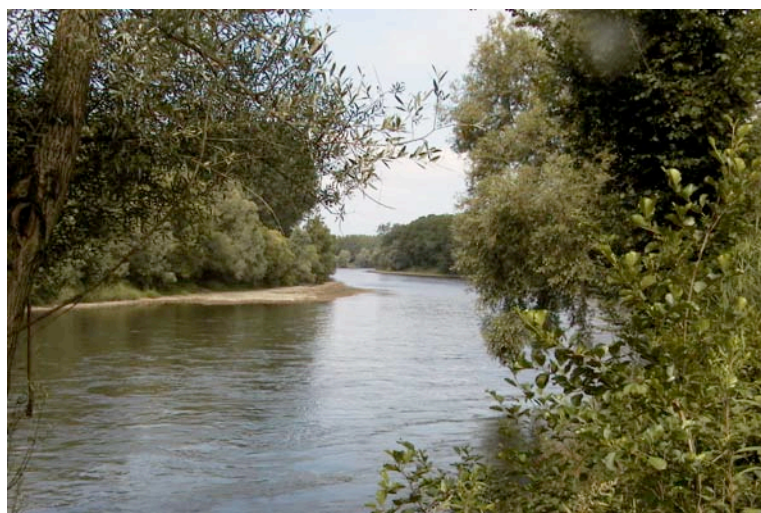
Mur bei Sieldorf