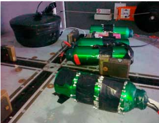
Bomb suicide attack, 11 December, Sweden

Prophet Muhammad by the Swedish painter, Lars Vilks. A second explosion occurred 10 minutes later, a few streets away from the first explosion. In this case, the suspected suicide bomber himself was the only fatality.