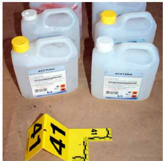
Precursors for home-made explosives, ETA, Portugal

The announcement, in June 2010, of the PKK/KONGRA-GEL intention to enter a more violent period of its history was immediately followed by the declaration of a cease-fire which was, in turn, belied by the bomb attack in Istanbul in October 2010. No execution of attacks in the EU show the PKK/KONGRA-GEL's double strategy of armed struggle in Turkey while at the same time seeking to gain a greater degree of legitimacy abroad. It is assumed that the organisation will continue to follow this double strategy. The terrorism threat posed by the PKK/KONGRA-GEL to EU Member States and the intention can currently be considered as relatively low. However the large number of PKK/KONGRA-GEL militants living in the EU and the continuing support activities in the EU, like large demonstrations organised in the past, show that the PKK/KONGRA-GEL is in a position to mobilise its constituency at any time and is an indication that it maintains the capability to execute attacks in the EU.