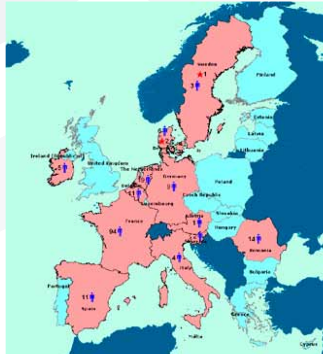
Figure 5: Number of failed, foiled or completed attacks and number of suspects arrested for Islamist terrorism in Member States in 2010

Member States who reported arrests related to Islamist terrorism are Austria, Belgium, Denmark, France, Germany, the Republic of Ireland, Italy, the Netherlands, Romania, Slovenia, Spain, Sweden, and the United Kingdom.