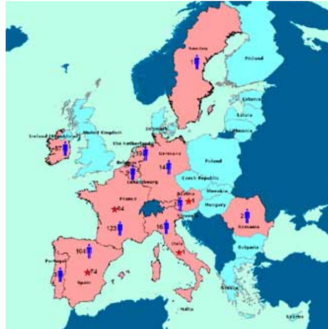
Figure 6: Number of failed, foiled or completed attacks and number of suspects arrested for separatist terrorism in Member States in 2010