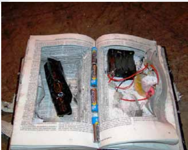
Parcel bomb, Greece

Increased violence in left-wing and anarchist attacks, which has been seen since 2007, persisted in 2010 . In Greece, attacks claimed the lives of six people in 2010. The explosion of a parcel bomb at the Ministry for Citizen Protection on 24 June killed a police officer. On 19 July, a journalist was murdered outside his house. This particularly violent attack involving firearms was claimed by the organisation Sekta Epanastaton and it could be linked to the assassination of a police officer in 2009. Both of these attacks were clearly designed to kill. Despite the fact that left-wing and anarchist extremists generally try to avoid casualties in most of their attacks, a 15-year-old boy died on 28 March when he manipulated an explosive device ostensibly placed to carry out a terrorist attack; his mother and sister were injured. During a demonstration in Athens on 5 May, anarchists caused a fire in a bank, which resulted in the death of three employees.