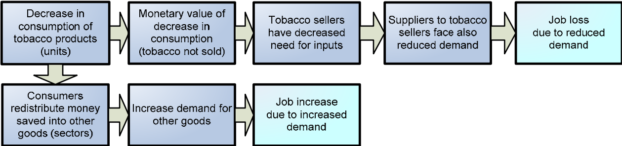
Figure 4.1: Conceptual I/O model

Three different matrices are used for a standard input-output model. The inter-industry transaction matrix describes the flow of goods and services between all individual sectors of an economy in a given year. The direct requirement matrix indicates the requirements for a particular industry to produce an average unit output. The total requirement matrix indicates the total requirements of all industries necessary for that industry to deliver a unit of output to final demand.