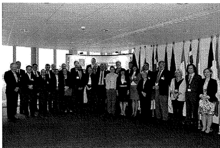
JSB appointees' plenary meeting on 15 June 2012

The JSB is looking forward to the challenges awaiting it in 2013, especially in terms of the review of Eurojust's legal framework and the ongoing EU Data Protection reform. As the Commission is currently working on the Eurojust Regulation, the JSB will follow with great interest the developments in this area and will actively participate to retain the existence of tailor-made rules and the present system of joint supervision. The data protection regime in place offers a high level of protection of personal data and legal certainty for individuals while respecting the operational needs of the organisation. The JSB stresses that data protection standards cannot be lowered and that the priorities for the JSB will remain the same – to protect properly the rights of individuals.