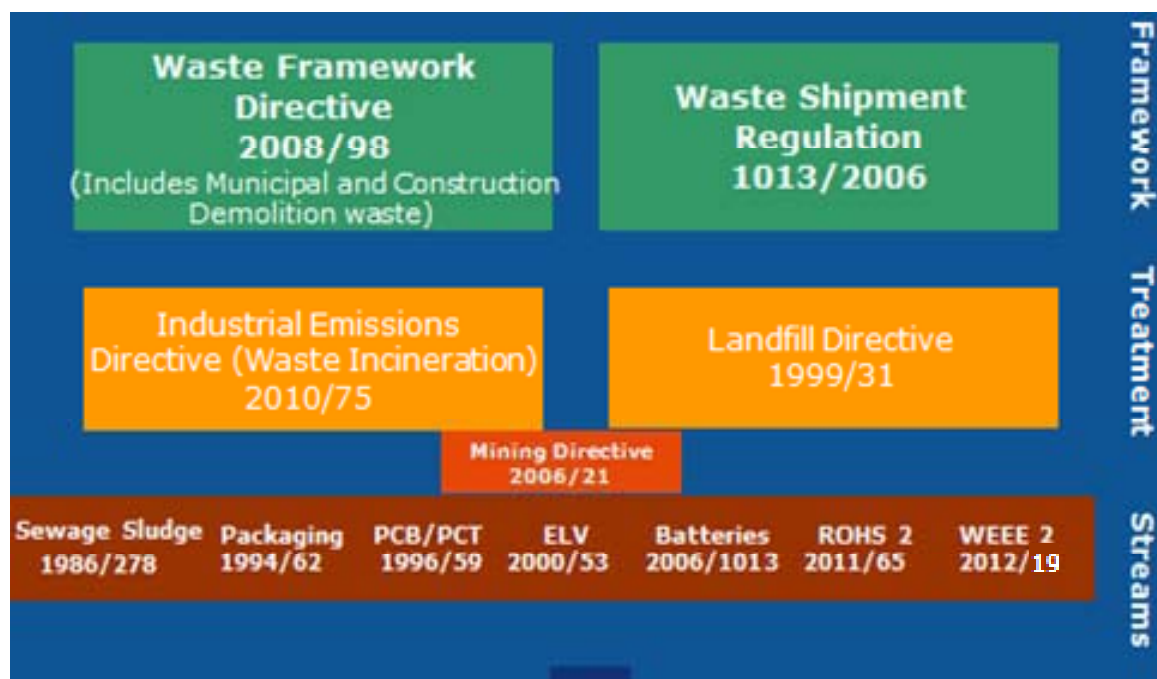
101 Table 1: Overview of EU waste legislation