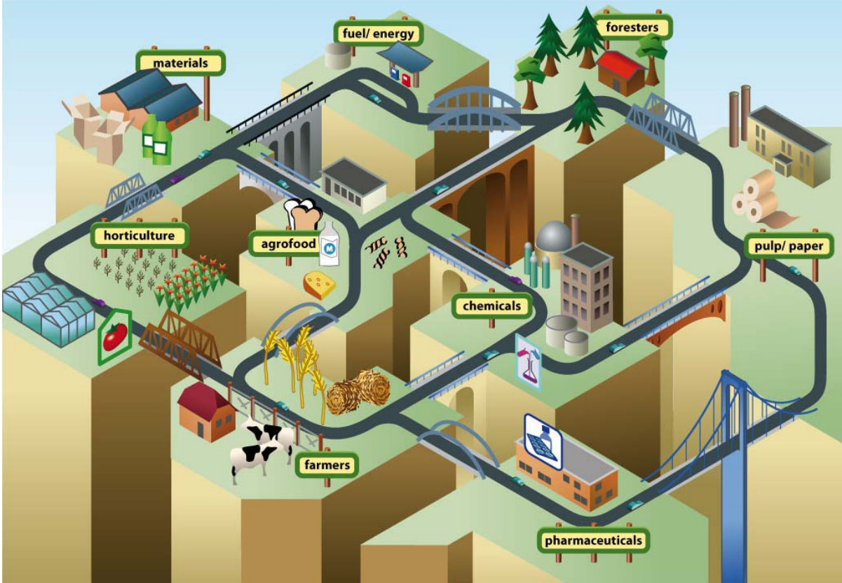
Figure 3: Bridging between the pillars – towards the Biobased Economy

BRIDGE will thus strengthen the sustainability and competitiveness of all biobased industries, by strengthening the innovation pillars . This increased innovation capacity will facilitate and accelerate the emergence of new sustainable value chains building on an innovative and economically strong infrastructure: effectively building the bridges towards new value chains (Figure 3).