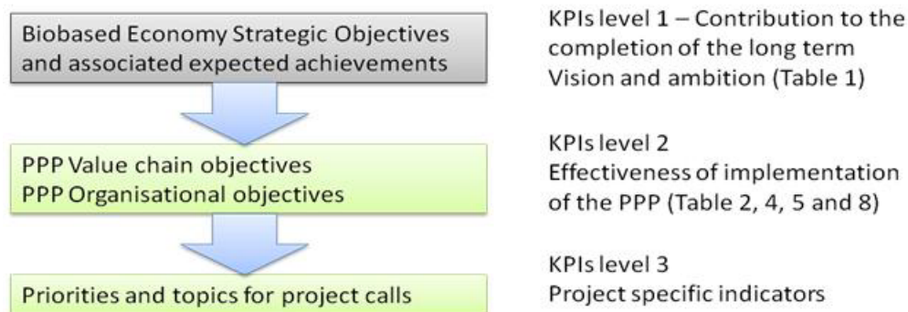
Figure 4: The different levels of KPIs

It is proposed to implement all validated technologies or processes at pilot scale within demonstration projects and in some cases flagships allowing the assessment of the programme progress with the help of an appropriate set of KPIs. Three levels of quantitative and qualitative Key Performance Indicators have been identified (see Figure 4).