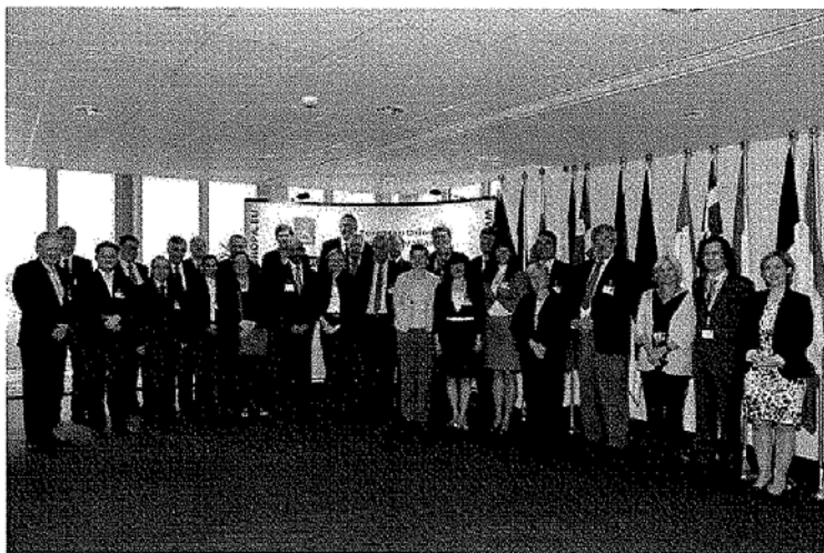
JSB appointees' plenary meeting on 15 June 2012

The JSB is looking forward to the challenges awaiting it in 2013, especially in terms of the review of Eurojust's legal framework and the ongoing EU Data Protection reform. As the Commission is currently working on the Eurojust Regulation, the JSB will follow with great interest the developments in this area and will actively participate to retain the existence of tailor-made rules and the present system of joint supervision. The data protection regime in place offers a high level of protection of personal data and legal certainty for individuals while respecting the operational needs of the organisation. The JSB stresses that data protection standards cannot be lowered and that the priorities for the JSB will remain the same – to protect properly the rights of individuals.