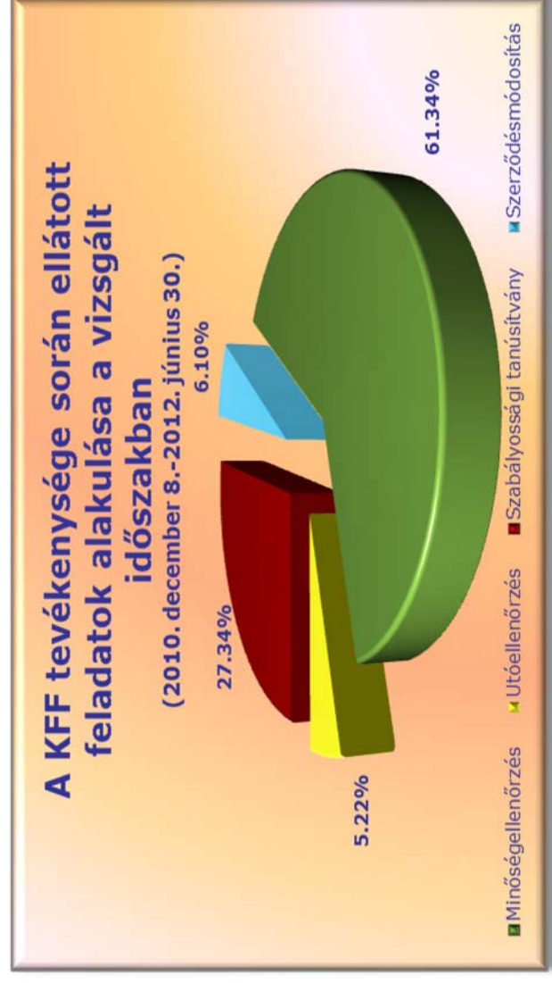
A KFF tevékenysége során ellátott feladatok alakulása a vizsgált időszakban Tasks performed by the KFF in the period under review