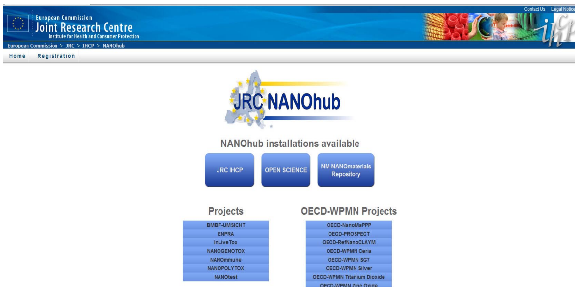
Figure 1: Structure of JRC NANOhub: projects hosted in February 2012

Users access a project-specific installation from the www.nanohub.eu website (Figure 1).