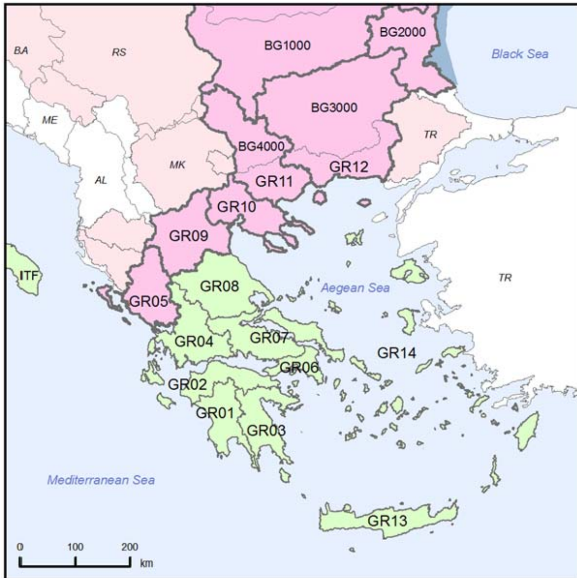
Figure 1.1: Map of River Basin District