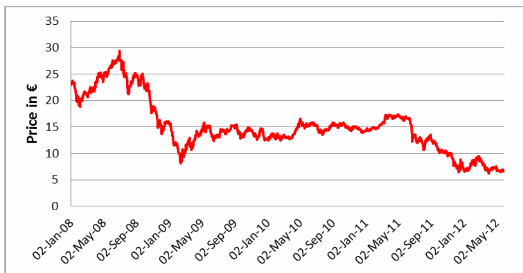
Figure 1: Carbon price evolution

Data for front-year futures contracts with delivery in December