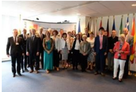
Plenary meeting in June 2015

This is a point which we from the JSB will continue to stress at every possible occasion, not only, as far as Eurojust is concerned, but also regarding the European Public Prosecutor's Office (EPPO). What applies to Eurojust certainly also applies to a front-organisation the EPPO is supposed to become. Strong and direct involvement of the Member States in the oversight on data protection is essential.” 6