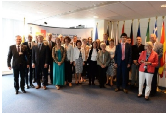
Plenary meeting in June 2015

This is a point which we from the JSB will continue to stress at every possible occasion, not only, as far as Eurojust is concerned, but also regarding the European Public Prosecutor's Office (EPPO). What applies to Eurojust certainly also applies to a front-organisation the EPPO is supposed to become. Strong and direct involvement of the Member States in the oversight on data protection is essential.” 6