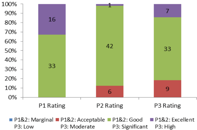
Chart 3: ReM ratings by pillar for 2015 new signed operations

In terms of strength of contribution to objectives (ReM Pillar 1), 33% of the 2015 new signatures were rated as "excellent", meaning a high contribution to both the countries' own development objectives and the Union's priorities for the country and/or region concerned. 67% of the operations rated "good" under Pillar 1. Those projects that are expected to make a "good" contribution are in line with mandate objectives and could make a high contribution to either the country's own development objectives or those of the Union and a moderate contribution to the other.