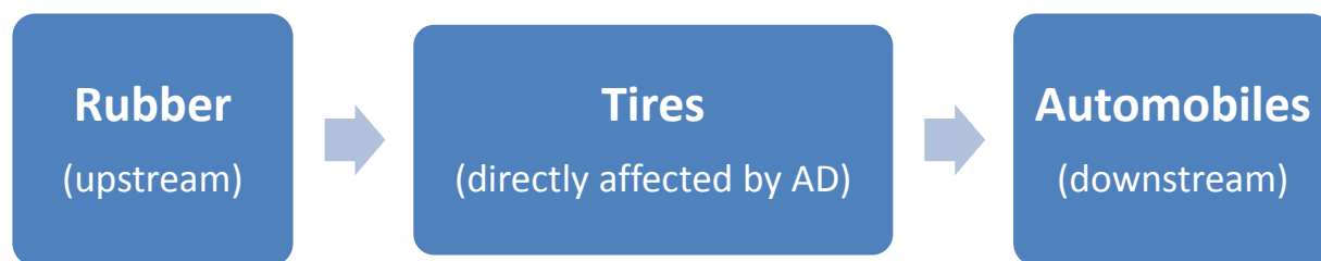
Figure 3: Fictional example of input flows in industry affected by AD

In this example, the tire sector is directly affected by AD action against China and in step 3 we already calculated the magnitude of the negative employment effects for the tire sector when AD duties are lowered if the EU grants MES to China. We will now estimate employment effects in the rubber and automobile industry even when these are not directly affected by AD actions. In reality, each sector will experience both direct and indirect effects