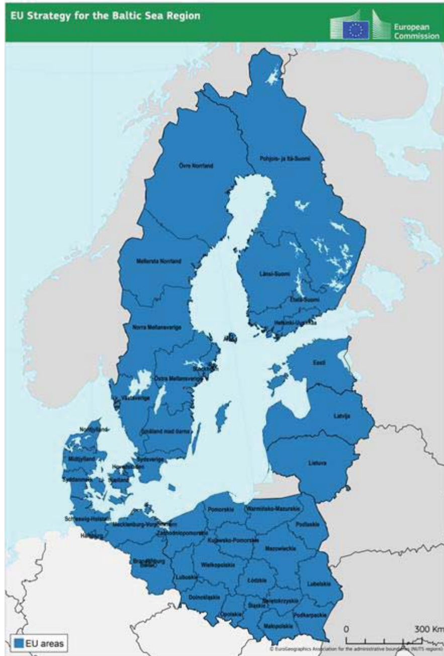
Annex 1: map of the EU Strategy for the Baltic Sea Region