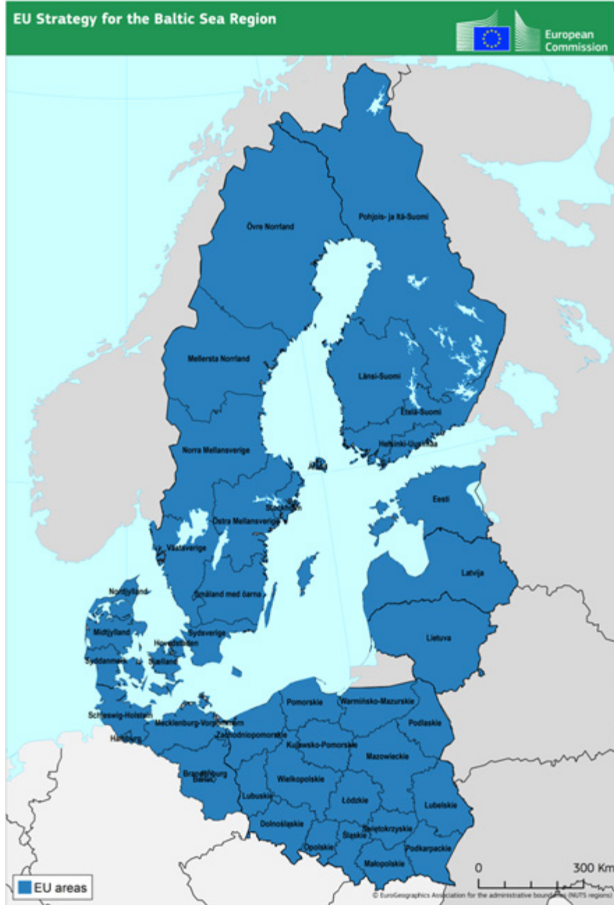
Annex 1: map of the EU Strategy for the Baltic Sea Region