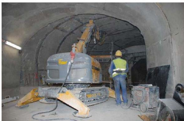
Figure 2: Example of NRMM without on-board power source: concrete spraying machine used in mining

Relevant product groups for the latter include professional cleaning machinery (see Figure 1) and certain types of construction or mining machinery (see Figure 2 and Figure 3).