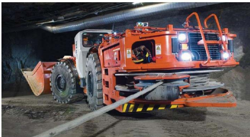
Figure 3: Example of NRMM without on-board power source: a wheel loader used in mining

The current NRMM definition would thus lead, after 22 July 2019, to a situation resulting in very similar types of equipment being regulated differently and inconsistently.