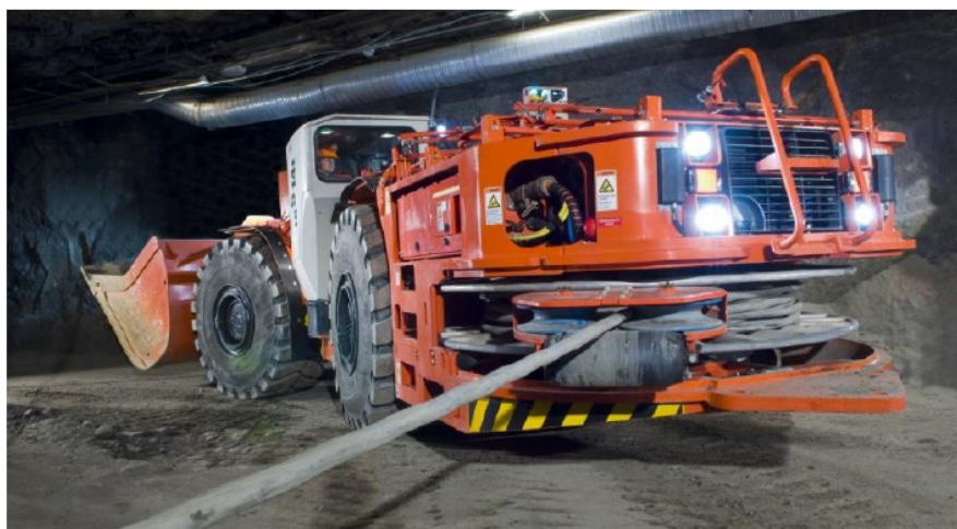
Figure 3: Example of NRMM without on-board power source: a wheel loader used in mining

The current NRMM definition would thus lead, after 22 July 2019, to a situation resulting in very similar types of equipment being regulated differently and inconsistently.