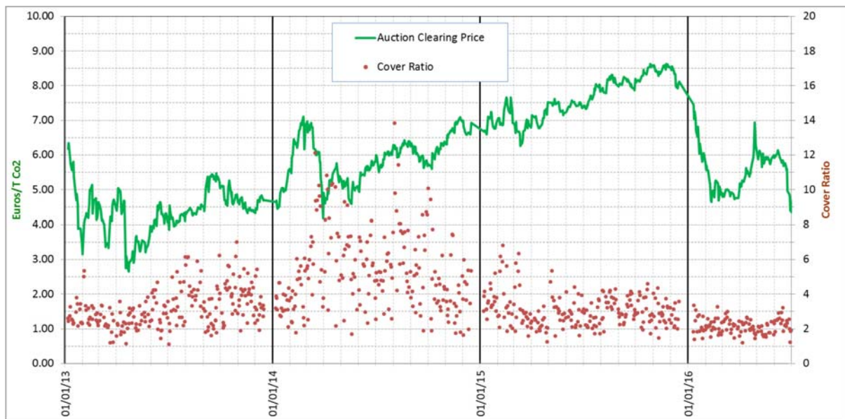
Figure: Overview of general allowances auctions from 2013 to 30 June 2016