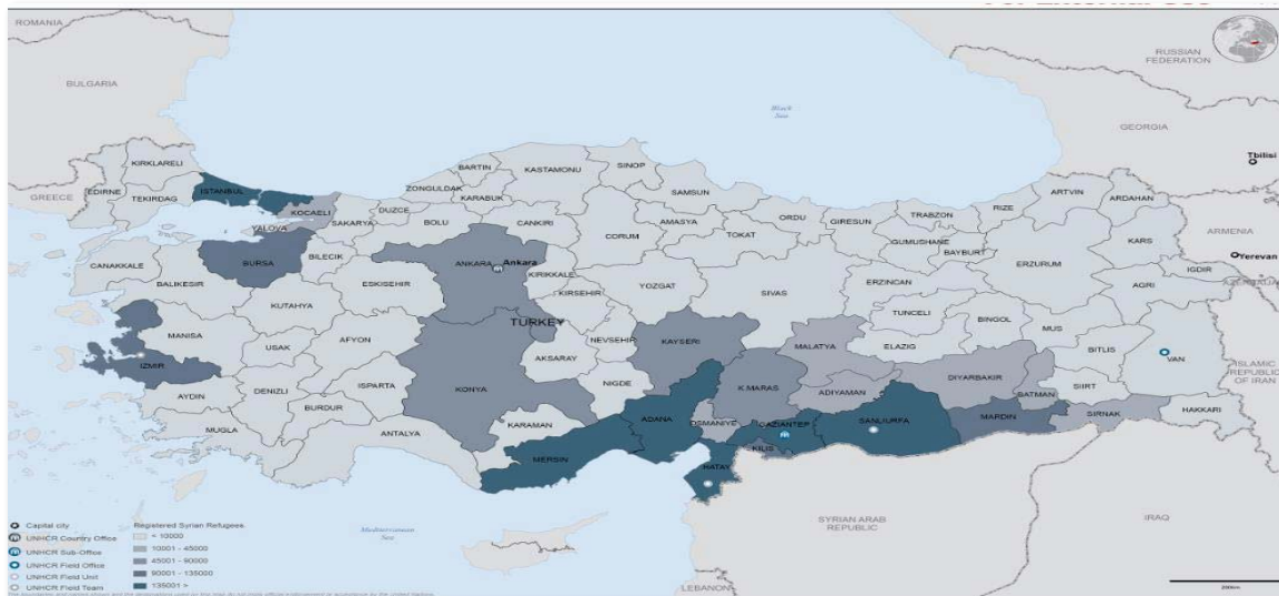
Provincial Breakdown of Syrian Refugees in Turkey, Source: UNHCR, December 2016

Turkey's geographical position makes it a prominent reception and transit country for many refugees and migrants. As a result of an unprecedented influx mainly due to the Syria conflict, the country has been hosting the highest number of refugees and migrants in the world, numbering more than 3 million. It includes 2.8 million registered Syrian refugees of which 10% reside in 26 camps established by the Turkish government in the south-east of Turkey, while the remaining 90% live outside of camps in urban, peri-urban and rural areas. To receive and host such high numbers of refugees and migrants, Turkey has been providing generous humanitarian and financial support.