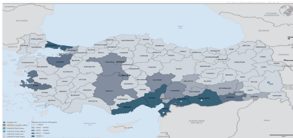
Provincial Breakdown of Syrian Refugees in Turkey

Turkey's geographical position makes it a prominent reception and transit country for many refugees and migrants. As a result of an unprecedented influx mainly due to the Syria conflict, the country has been hosting the highest number of refugees and migrants in the world, numbering more than 3 million. It includes 2.8 million registered Syrian refugees of which 10% reside in 26 camps established by the Turkish government in the south-east of Turkey, while the remaining 90% live outside of camps in urban, peri-urban and rural areas. To receive and host such high numbers of refugees and migrants, Turkey has been providing generous humanitarian and financial support.