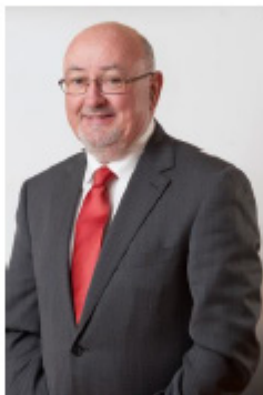
Caoimhghín Ó Caoláin TD (SF) [Chair]