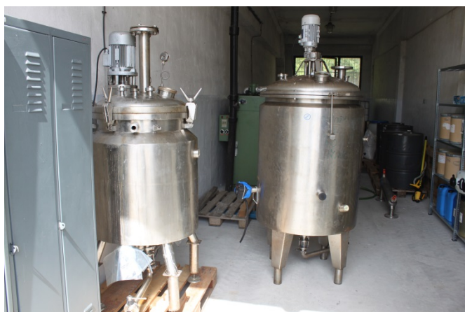
Figure 1. Pictures of the seizure of an industrial scale laboratory in Prievidza, Slovakia.

Contributions reported to Europol by the Member States indicated small scale illicit synthesis of NPS with one exception. In July 2016, the Slovak Police in collaboration with the Polish Police seized an industrial scale laboratory in Prievidza, Slovakia, where the production of 3-CMC (3-chloromethcathinone or clophedrone) and N -ethylnorpentedrone took place (Figure 1).