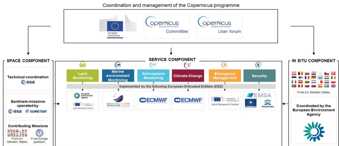
Table 3: Sentinel sensors and launch dates as planned in the Indicative Copernicus Constellation Schedule 20