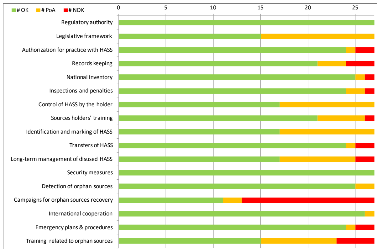
Figure 2. Overview of HASS Directive implementation in the 27 EU Member States (OK – Point of Attention PoA – Difficulties in implementation NOK)

Figure 2 presents an overview of the HASS Directive implementation status in the 27 EU Member States. Results are presented as implemented (OK), require attention (PoA) and Difficulties in implementation (NOK). As can be deduced from the graph analysis, there is, in general, a good compliance with the HASS Directive requirements.