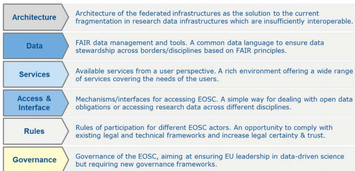
Figure 1 – EOSC Model action lines

The model describes a pan-European federation of data infrastructures built around a federating core and providing access to a wide range of publicly funded services supplied at national, regional and institutional levels, and to complementary commercial services. The model includes six actions lines: (a) architecture, (b) data, (c) services, (d) access and interfaces, (e) rules and (f) governance (Figure 1, below).