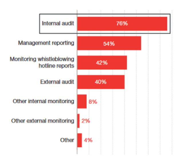
Figure 2.1 – Source: PWC (2016) – Adjusting the lens on economic crime. Preparation brings opportunity back into focus, Global Crime Survey 2016

In certain areas, violations of EU law are often difficult to unmask since evidence is difficult to collect. Reports by whistleblowers with insider access to such evidence can be crucial in those cases. Consequently, ensuring that whistleblowers feel safe to report can feed enforcement action and enhance its effectiveness (see Figure 2.2).