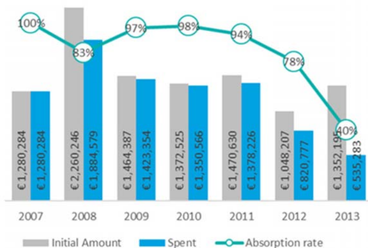
Figure 2 Initial procurement amount committed, paid and absorption rate across the period 2007-2013 by 31 March 2017

Source: ICF analysis of DG Budget ABAC data.