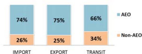
AEO involvement in supply chain in 2017

possibilities to develop them further, mainly with the aim of enhancing the analysis of AEO benefits and monitoring the impact of mutual recognition.