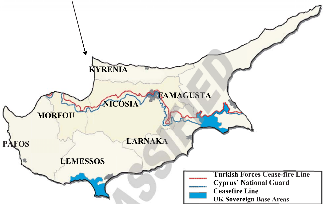
Annex table I. Divisional Police Headquarters (since 1974, KYRENIA is out of operation, as a result of Turkish Occupation)