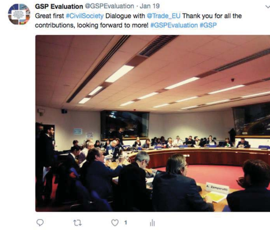
Figure 2: Twitter update from the first Civil Society Dialogue

The 2 nd CSD in Brussels was organised on 25 September 2017. The external consultant presented its progress and preliminary findings from the Final Interim Report. EU stakeholders were then given the opportunity to refer their questions regarding the midterm evaluation towards the Commission and the consultant and to provide feedback on the Final Interim Report. The second CSD was the final contact between the external consultant and the stakeholders, thus providing them a last chance to participate in the stakeholder engagement and consultation. 37