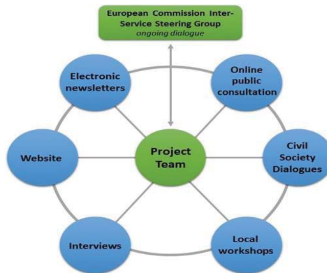
Figure 1: Overview of the stakeholder consultation activities and tools

A range of consultation activities and tools was employed to ensure a comprehensive and well-balanced consultation process. The activities and tools included a dedicated project website and electronic outreach tools, a 12-week Online Public Consultation, interviews and meetings with relevant stakeholders, Civil Society Dialogues (CSDs) in Brussels, local workshops in Bangladesh, Ethiopia, Bolivia and Pakistan and an ongoing dialogue with the European Commission Inter-Service Steering Group (ISSG).