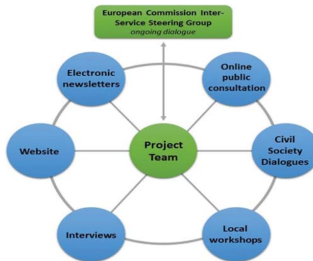
Figure 1: Overview of the stakeholder consultation activities and tools

A range of consultation activities and tools was employed to ensure a comprehensive and well-balanced consultation process. The activities and tools included a dedicated project website and electronic outreach tools, a 12-week Online Public Consultation, interviews and meetings with relevant stakeholders, Civil Society Dialogues (CSDs) in Brussels, local workshops in Bangladesh, Ethiopia, Bolivia and Pakistan and an ongoing dialogue with the European Commission Inter-Service Steering Group (ISSG).