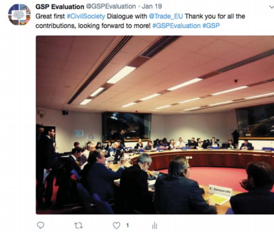
Figure 2: Twitter update from the first Civil Society Dialogue

The 2 nd CSD in Brussels was organised on 25 September 2017. The external consultant presented its progress and preliminary findings from the Final Interim Report. EU stakeholders were then given the opportunity to refer their questions regarding the midterm evaluation towards the Commission and the consultant and to provide feedback on the Final Interim Report. The second CSD was the final contact between the external consultant and the stakeholders, thus providing them a last chance to participate in the stakeholder engagement and consultation. 37