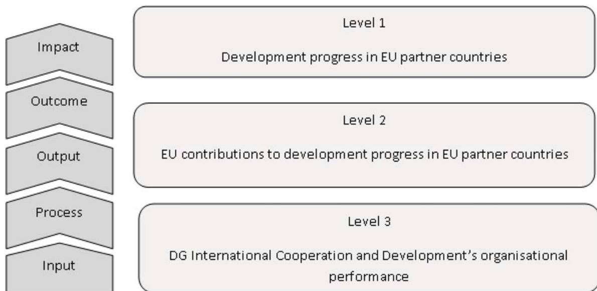
Figure 1 – The first EU Results Framework three-level structure

The EU Results Framework aggregated results of interventions funded by key external assistance financing instruments 8 . The first EU Results Framework was structured around three levels of results 9 . This functional structure was welcomed by Council conclusions 10 . Level 1 corresponded to development progress of partner countries; Level 2 corresponded to outcomes and outputs of EU funded interventions illustrating the EU contribution to such progress in partner countries; and Level 3 related to Directorate-General for International Cooperation and Development 's organisational performance - see diagram below.