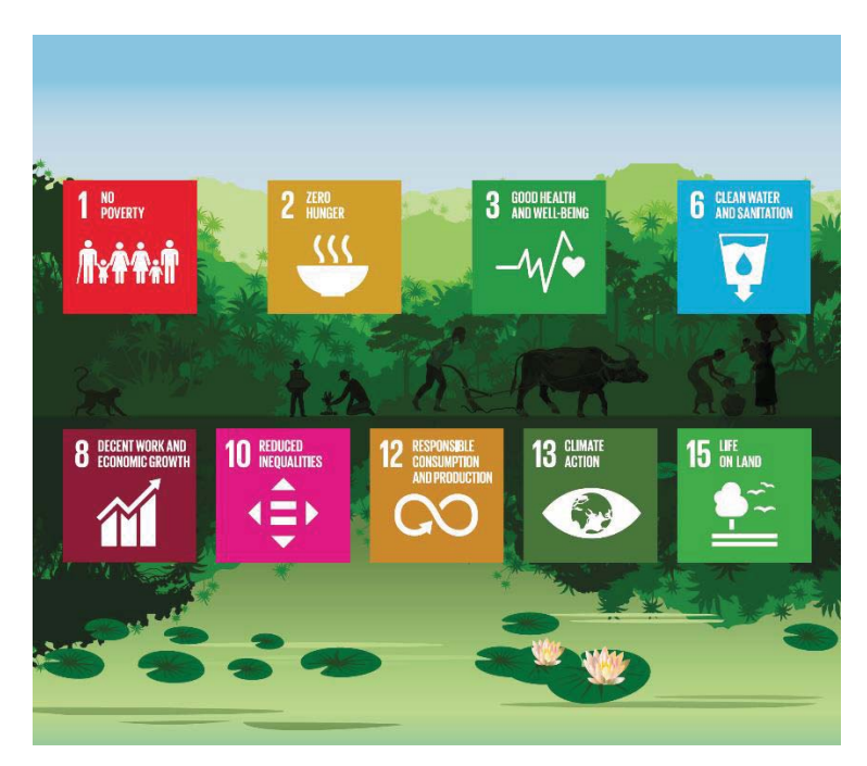
Figure 1 - Forest goods and services supporting the UN Sustainable Development Goals

Further EU measures to protect forests would be consistent with international agreements and commitments, which fully acknowledge the need for ambitious action to reverse the trend of deforestation. The Paris Agreement on Climate Change and the Global Strategic Plan for Biodiversity 2011-2020 adopted under the UN Convention on Biological Diversity and the Aichi Biodiversity Targets promote sustainable forest management, protection and restoration efforts<sup>14</sup>. Reducing forest loss and degradation is a priority under the UN Strategic Plan on Forests<sup>15</sup>. Strengthening efforts to manage forests sustainably is also central to the UN 2030 Agenda for Sustainable Development as forests play a multifunctional role that supports the achievement of most Sustainable Development Goals.