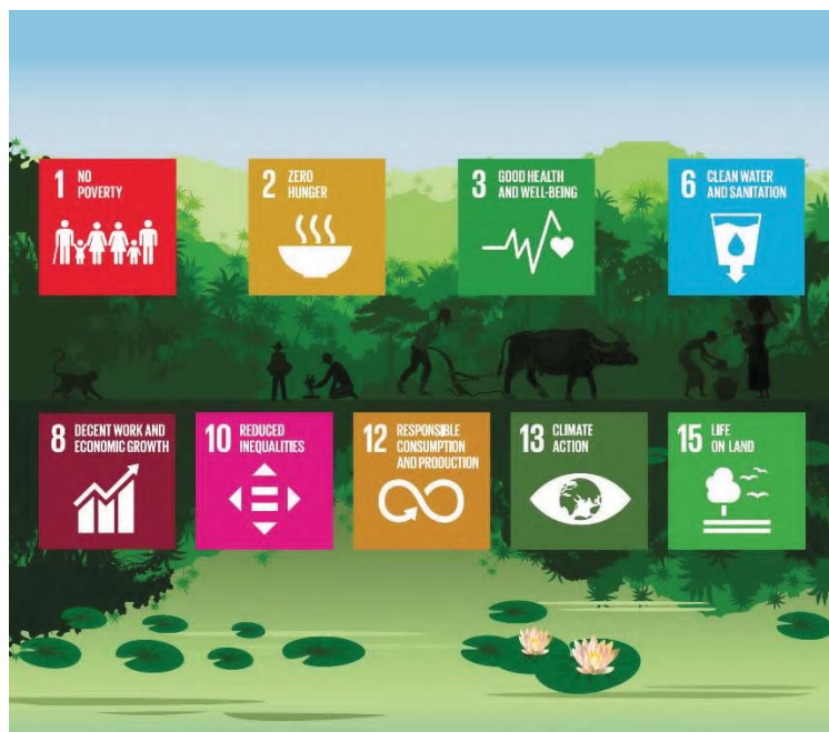
Figure 1 - Forest goods and services supporting the UN Sustainable Development Goals

Further EU measures to protect forests would be consistent with international agreements and commitments, which fully acknowledge the need for ambitious action to reverse the trend of deforestation. The Paris Agreement on Climate Change and the Global Strategic Plan for Biodiversity 2011-2020 adopted under the UN Convention on Biological Diversity and the Aichi Biodiversity Targets promote sustainable forest management, protection and restoration efforts xiv . Reducing forest loss and degradation is a priority under the UN Strategic Plan on Forests xv . Strengthening efforts to manage forests sustainably is also central to the UN 2030 Agenda for Sustainable Development as forests play a multifunctional role that supports the achievement of most Sustainable Development Goals.