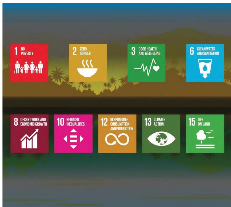
Figure 2 - Impacts of deforestation on Sustainable Development Goals