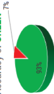
Accuracy of GREEN