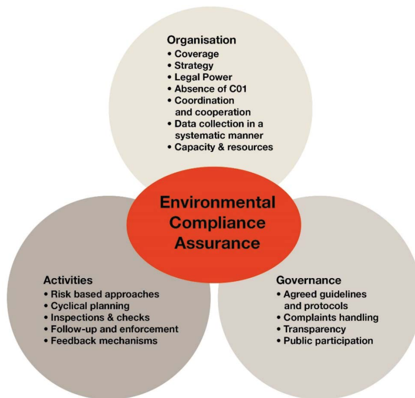
Figure 4: Dimensions of environmental compliance assurance 62

Figure 4 illustrates the principal building blocks of each dimension. The building blocks represent individual elements or activities that must be carried out or initiated to deliver a compliance assurance assessment system.