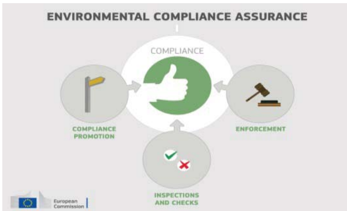
Figure 1: The three classes of environmental compliance assurance intervention

A more detailed description of each intervention class is set out in Annex 4.