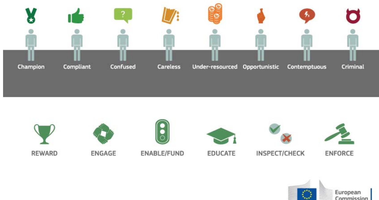
Figure 2: Types of conduct which can result in different levels of compliance and responses to these

By the same token, no one type of response is ideally suited to deal with all types of non-compliant conduct. Enforcement and monitoring are clearly important but so too are awareness-raising, positive engagement with duty-holders and practical support measures. Compliance assurance is adaptable allowing for a mix of compliance promotion, monitoring and enforcement measures, depending on the nature of the non-compliance.