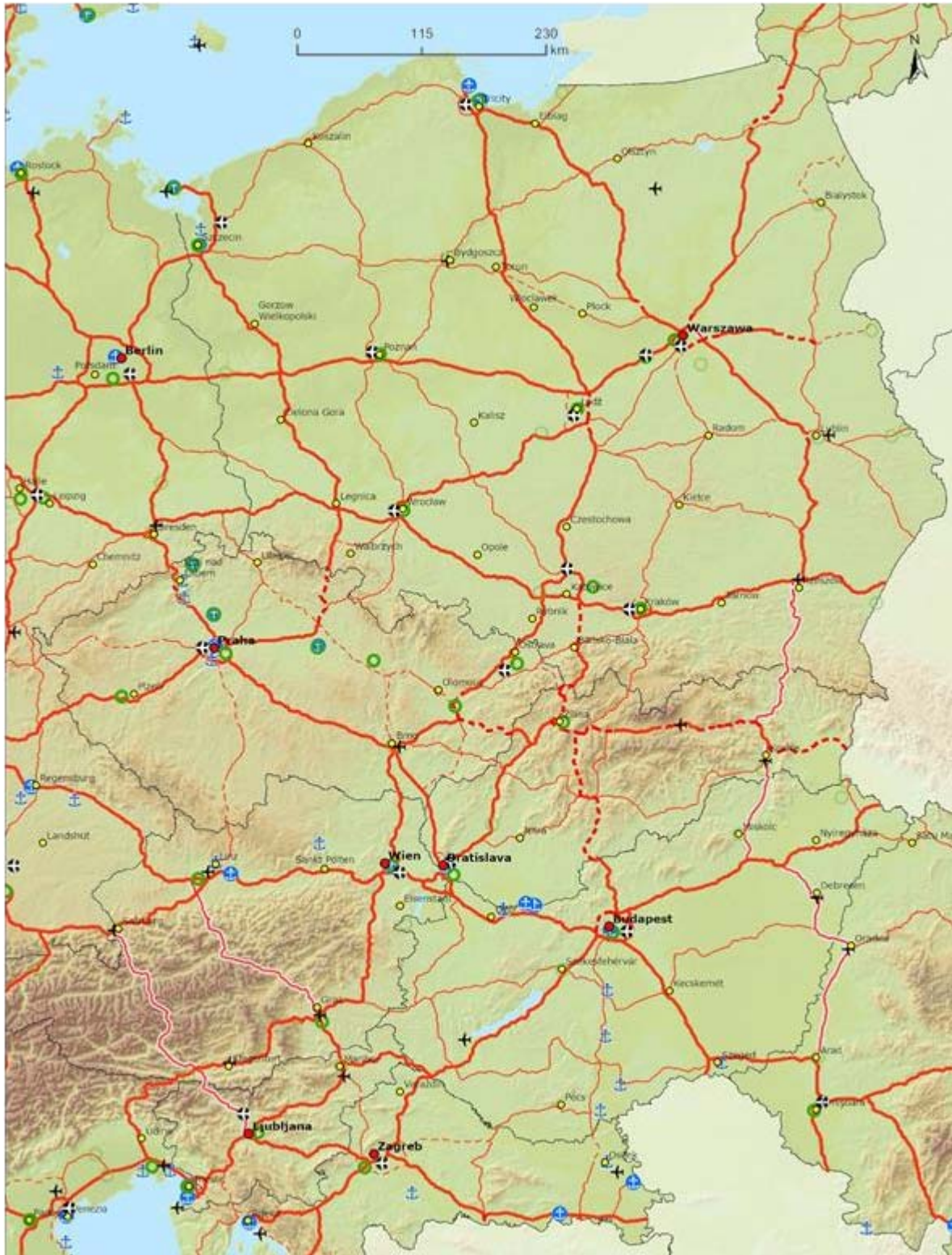
Roads Core Roads Extended Core Roads Comprehensive Compr Core Urban Nodes