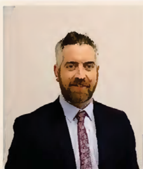
Christopher O'Sullivan TD