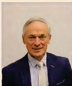
Richard Bruton TD Fine Gael