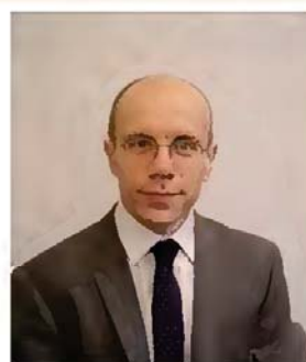
Darren O'Rourke TD Sinn Féin