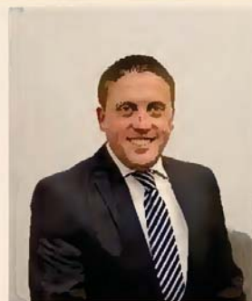
Cormac Devlin TD Fianna Fáil