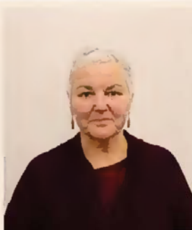
Brid Smith TD