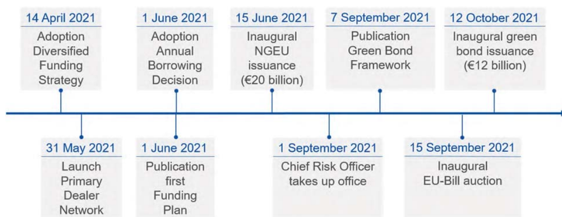
Figure 1: Milestones in building the diversified funding strategy

The NextGenerationEU funding programme is based on five key enablers: