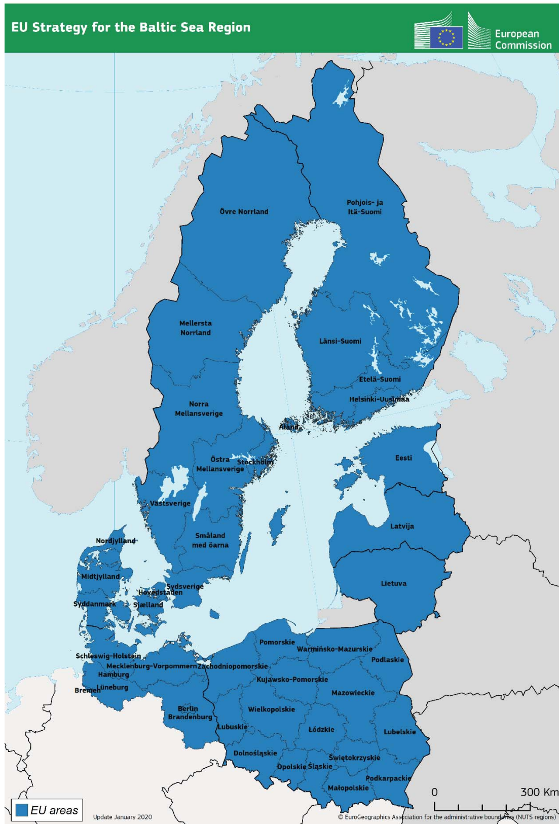
Annex 1: map of the EU strategy for the Baltic Sea region