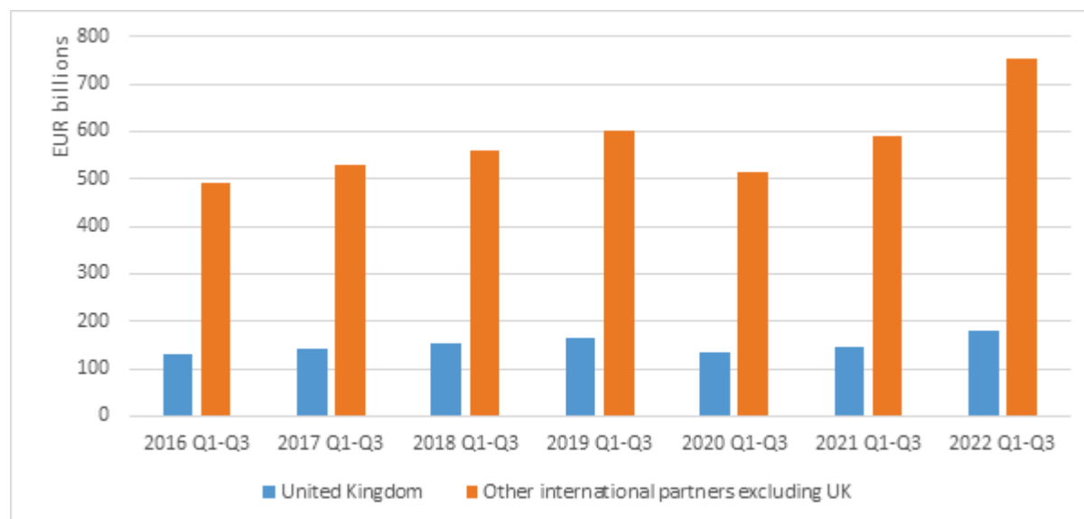
Figure 4: EU exports of services to the United Kingdom and other international partners (2016 - 2022)

Also looking at the longer term , both EU exports and imports of services with the United Kingdom were less dynamic in comparison with EU trade with other international partners. While in 2022, the EU total trade in services with its international partners excluding the United Kingdom increased by 51% compared to the first three quarters of 2016, this increase was lower in the case of trade in services with the United Kingdom: 38% when compared to the same period of 2016 (Figures 4 and 5).