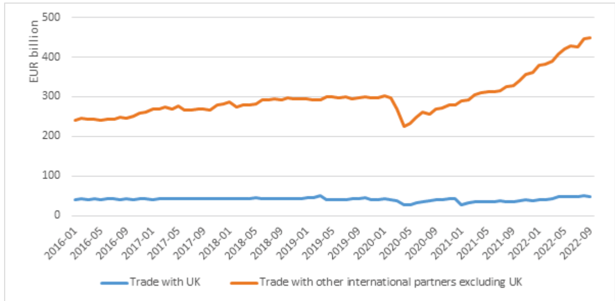
Figure 2: EU trade in goods with the United Kingdom and other international partners