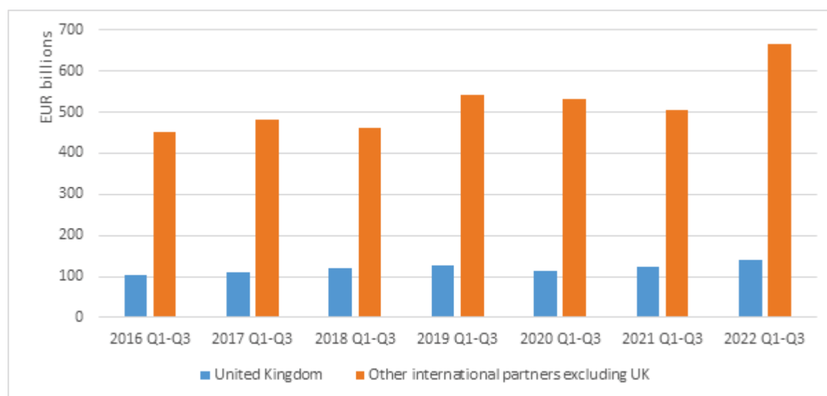
Figure 5: EU imports of services from the United Kingdom and other international partners (2016 – 2022)