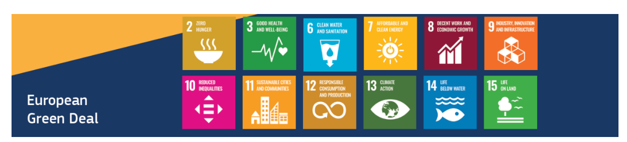
Figure 3: Contribution to the SDGs of headline ambition 'European Green Deal'

The EU made moderate progress on SDG 2 on sustainable agriculture, SDG 6 on water, SDG 7 on energy, SDG 11 on sustainable cities, SDG 12 on consumption and production and SDG 14 on oceans. More progress is expected in coming years on SDG 13 on climate action<sup>29</sup> and SDG 15 on biodiversity on land.