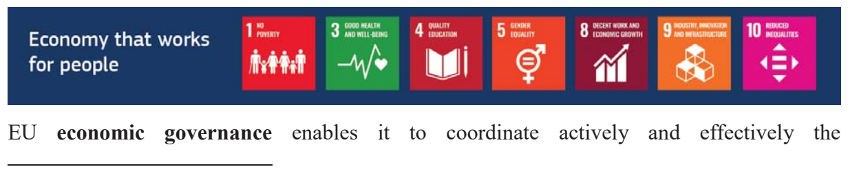
Figure 4: Contribution to the SDGs of headline ambition 'an economy that works for people'

By helping economies grow and by reducing poverty and inequality, the EU is also making direct contributions to several interconnected SDGs. Significant progress was made on reducing poverty and social exclusion (SDG 1) and on the economy and the labour market (SDG 8). However, only moderate progress was made on reducing inequalities (SDG 10).