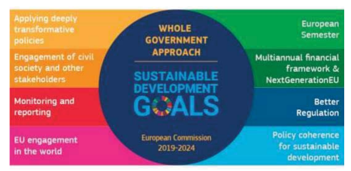
Figure 1: The EU's 'whole-of-government' approach

The Commission's comprehensive or " whole of government " approach to implementing the SDGs comprises several strands as depicted in the Figure below: