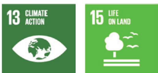
Goal 13. Take urgent action to combat climate change and its impacts.