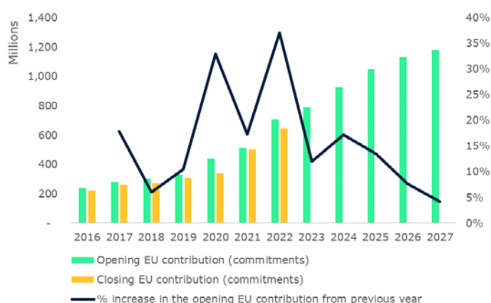
Figure 2 EU contribution to Frontex (2016-2027)

Source: ICF, based EU budget data from MFF 2014-2020 and MFF 2021-27.